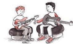
Young music leadership