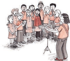
Class music lessons