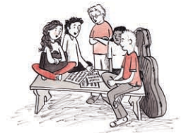
Young people reflecting together