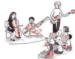
Professional musical ensembles