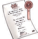
Awards (graded music exams, arts awards, prizes etc.)