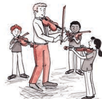
Group music lessons