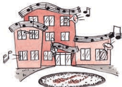
Specialist schools & colleges, & centres for advanced training