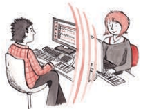
Web-based social music making