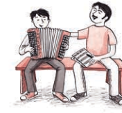
Parents/carers & the home environment