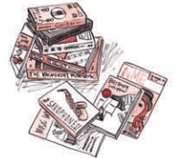
Books, magazines, DVDs