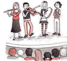
Performing & showcasing