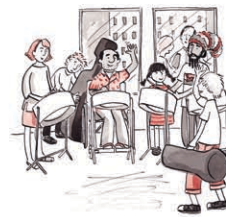
Community music organisations