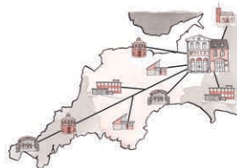
Arts Council England Bridge Organisations